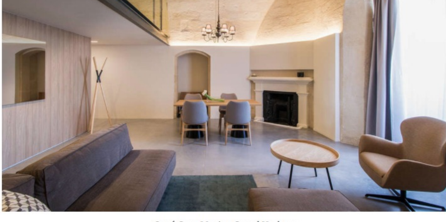
Cugó Gran Macina Grand Harbour

Originally built in 1554, the landmark structure that now houses the hotel's expansive 21 suites—all with unobstructed views of a magnificent harbor—is home to high-vaulted ceilings and an amazing rooftop.