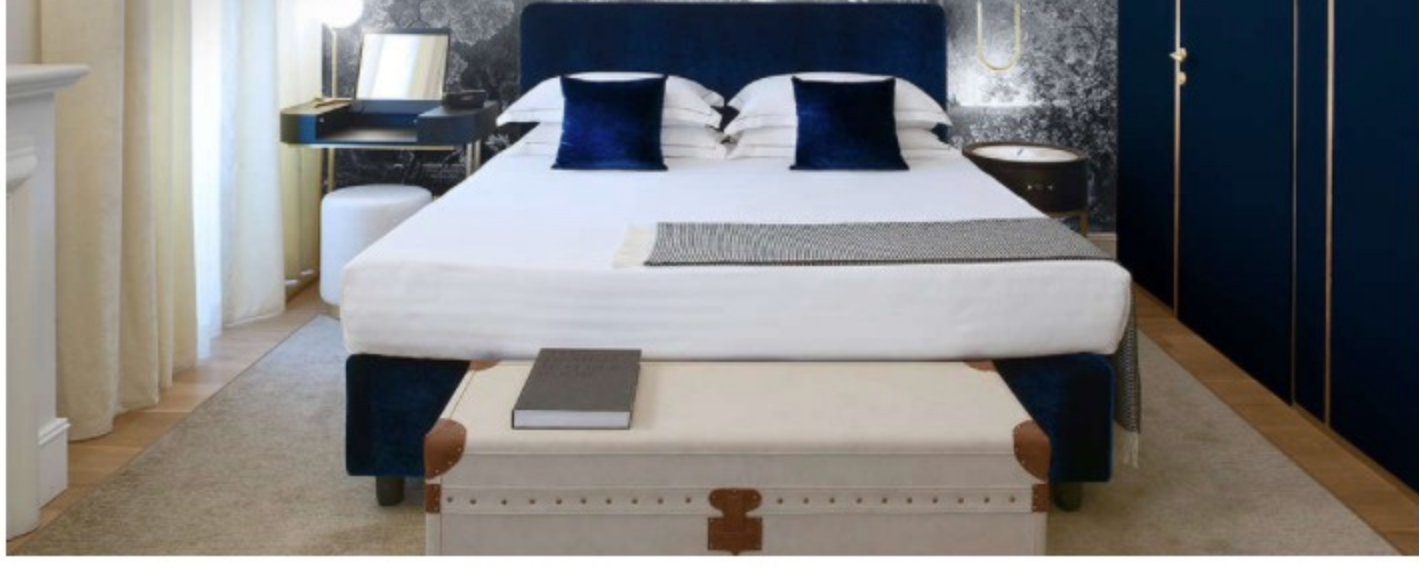
Elizabeth Unique Hotel – Rome, Italy

The 33-room townhouse is a hive of sophisticated design and international allure, with a bounty of arched walls, lacquered wooden panels, reproduced antique wallpaper prints, canopy beds, couture fabrics, and carefully curated artwork setting the stage.