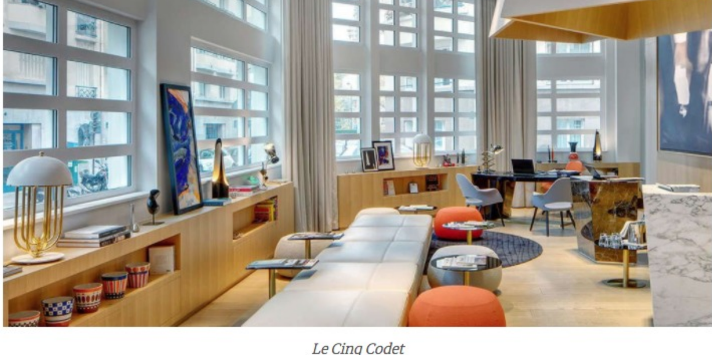
Le Cinq Codet

Showcasing unique, graphic architecture—envision the prow of an ocean liner rising above traditional Haussmann buildings—Le Cinq Codet presents 67 rooms that each evoke an artistic loft experience.